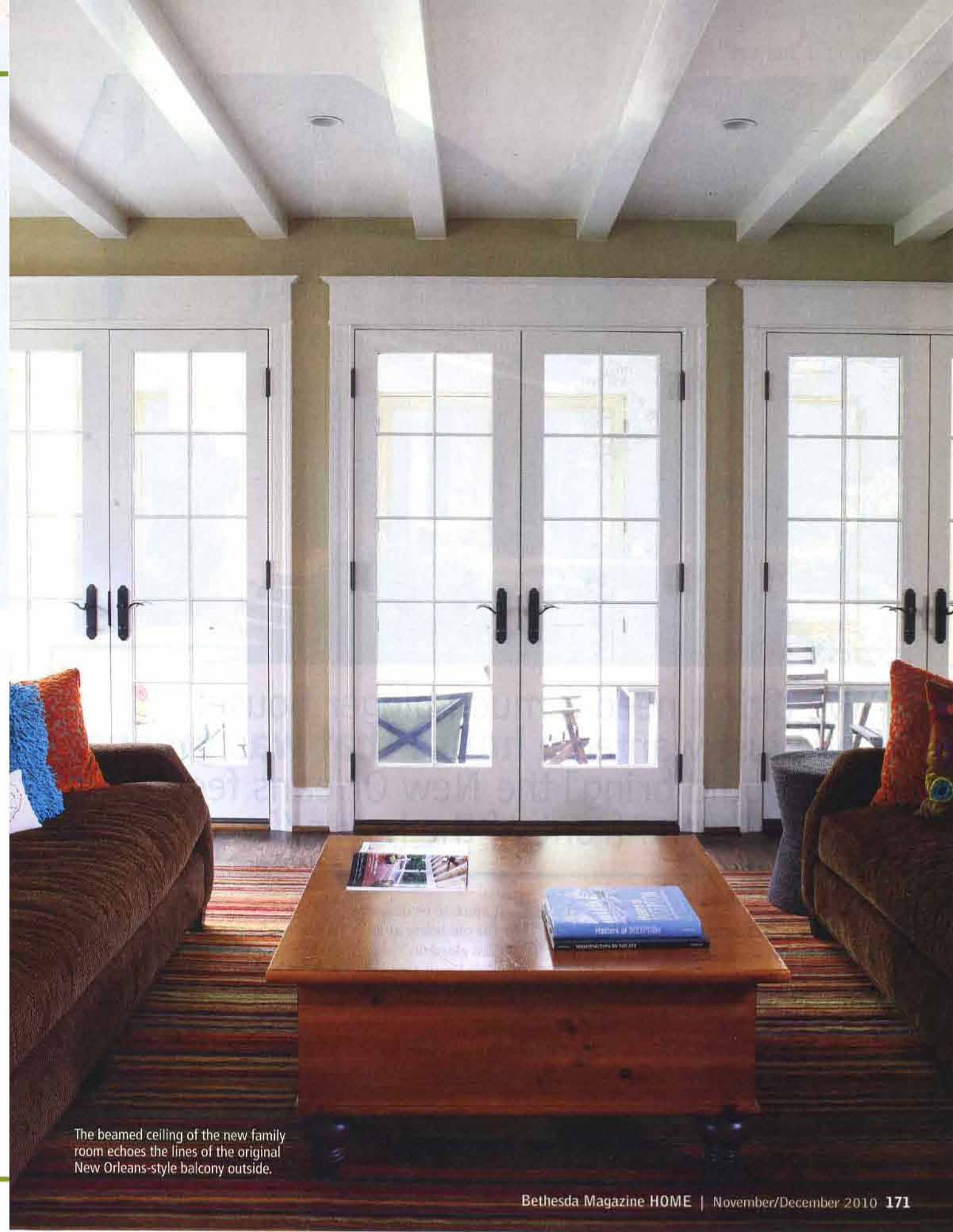
The beamed ceiling of the new family room echoes the lines of the original New Orleans-style balcony outside.

"Living space is the most direct connection to how you live every day and how you get your kids to live," Goldman says. ►