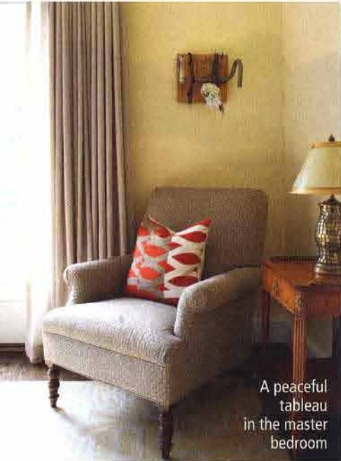
A peaceful tableau in the master bedroom

Decker had designed Honest Tea's industrial-looking office space on Bethesda Avenue, and "she and I worked very well together," Goldman says. "We have the same aesthetic."