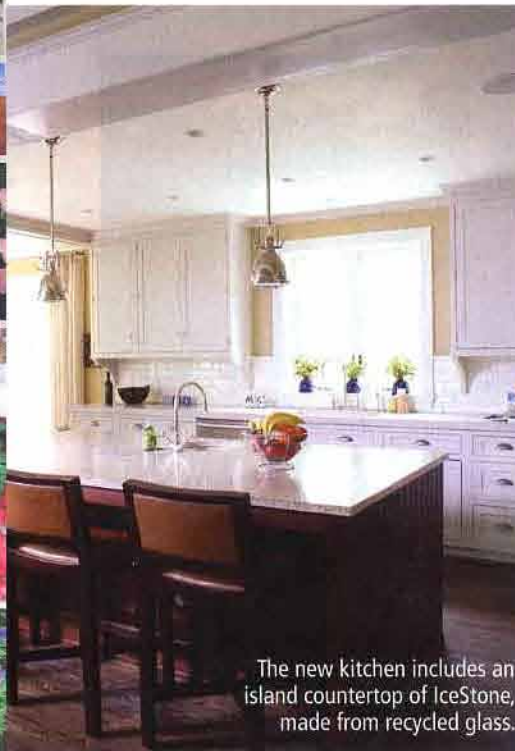
The new kitchen includes an island countertop of IceStone, made from recycled glass.

porated elements that would save them from having to use too much artificial light. Glass bricks built into the floor of the master-bedroom balcony allow sunlight into the screened porch below. And a Solatube—a tube that runs from the roof to a space inside where a skylight isn't feasible—directs sunlight into the windowless upstairs hallway. It's so bright there now that a guest once asked how to turn off the light. Goldman says the renovation increased the size of the house by 30 percent, while reducing the couple's utility costs by the same percentage.