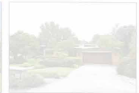
11743 Gainsborough Rd, Potomac Offered at $989,800