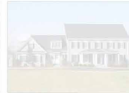
14420 Sugarland Drive, Poolesville Offered at $1,949,800