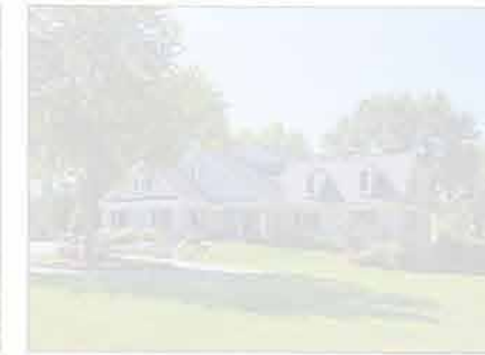
12810 Glen Road, North Potomac Offered at $2,298,800