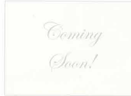
5907 Kingswood Road, Bethesda Offered at $1,449,800