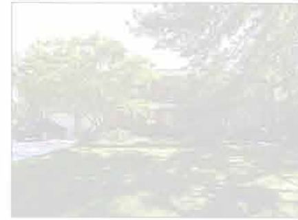
9804 Glenolden Drive, Potomac Offered at $1,478,800