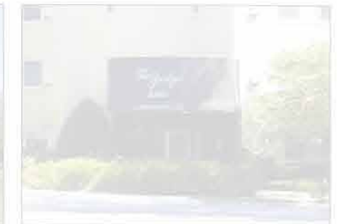
5315 Connecticut Ave. NW #502 Offered at $254,800