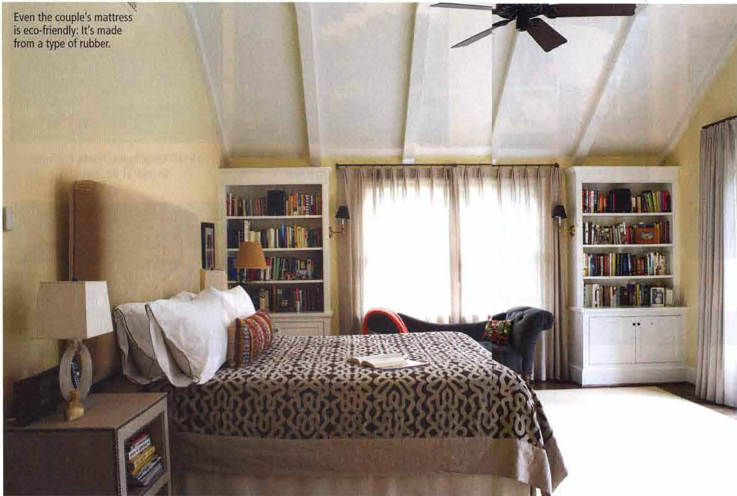
Even the couple's mattress is eco-friendly: It's made from a type of rubber.

Inside, Decker incorporated beams across the new family room ceiling to