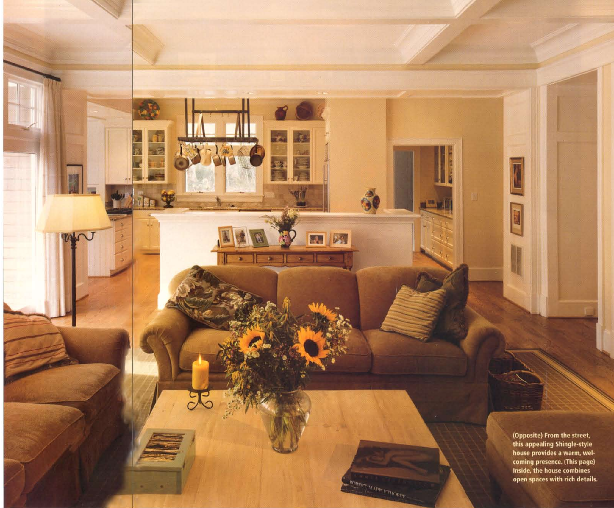
(Opposite) From the street, this appealing Shingle-style house provides a warm, welcoming presence. (This page) Inside, the house combines open spaces with rich details.

It also carves out an intimate entry courtyard for the house. "The two arms of the house seem to greet you," she says. ■ With a lot that sloped up from the street, there was a danger that the house would seem too tall as it was approached. As is typical of Shingle-style designs, the second floor is built into the roof. This made construction somewhat more challenging, but the low sloping roofs