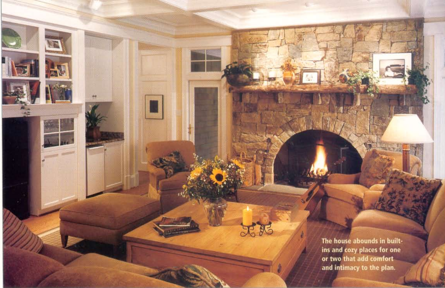
The house abounds in built-ins and cozy places for one or two that add comfort and intimacy to the plan.